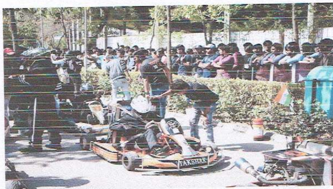
Photo 2: Team Takshak participated in International Go-Kart Championship